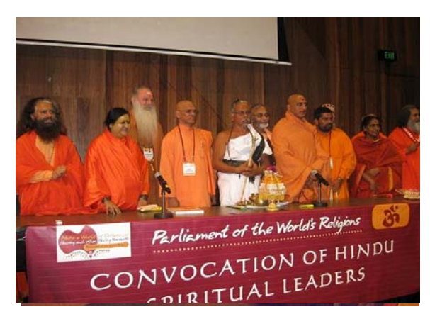
Convocation of Hindu Religious leaders

occasion. Chanting by members of ISKCON, sacred dances from Bali, Indonesia, Indian classical dance etc were other programmes in these sessions.