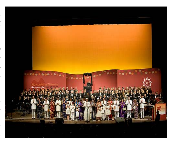
Members of the Zorastrian faith with Melbourne Philharmonic Orchestra offering prayers at the Inaugural session

The Parliament of Religions brought forth much needed understanding about several topics of national and international importance in the current times. Focus was particularly made about the understanding of indigenous religions and cultures of the world. The Australian indigenous