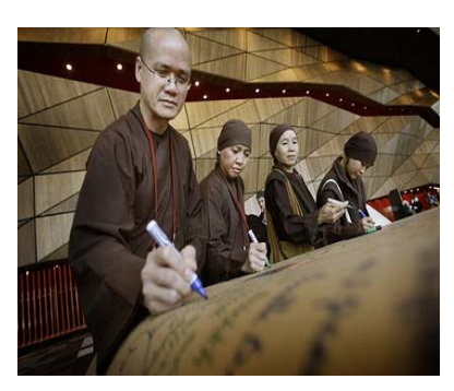
Delegates signing the petition to the in practic-Copanhagen summit

people, along with other indigenous elders gave their account of the struggles they undergo