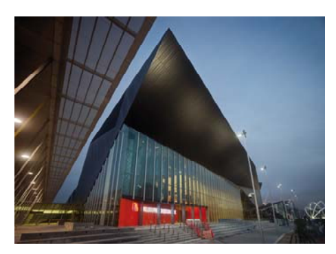
Melbourne Exhibition and Convention Centre

The tremendous response to participate in the Parliament of World's Religions (PWR) evinced interest from some countries and, subsequently, Cape Town in South Africa hosted the PWR in 1999 followed by Barcelona, Spain in 2004. In 2007, members of the CPWR visited Melbourne to explore the possibility of Australia hosting the PWR. The committee also visited Singapore and Delhi, other contenders to the event. Ultimately, the committee chose Melbourne as the venue for hosting the PWR in 2009. A local committee