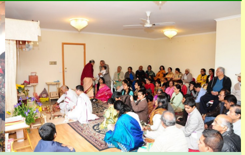
Melbourne Centre—inauguration Ceremony on 24th & 25th at 5-7 Angus Avenue, Ringwood.

Bhagavad Gītā from Thursday to Saturday of prescheduled weeks at Monash University Clayton Campus of Law, Wellington Road (L. Theatre L1). The Thursday and Friday sessions were from 7:45 p.m. to 8:45 p.m. and the sessions on Saturdays were from 11 a.m. to 12 noon. The recordings of these discourses are available in Audio, Video and MP3 formats.