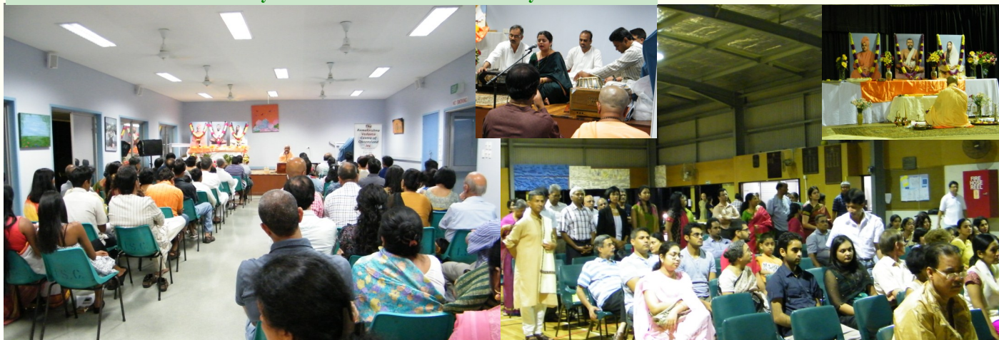
Brisbane Centre—the birth anniversary of Holy Mother and Kalpataru Day celebration (left) and the birth anniversary of Sri Ramakrishna (right) Inset—singing by devotees and the shrine.