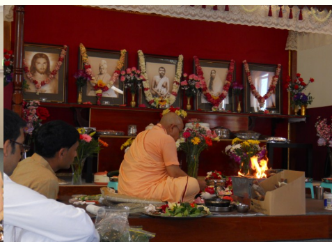
Perth Centre—worship on Shivaratri and on the birth anniversary of Sri Ramakrishna.