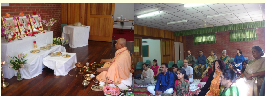
Adelaide—the annual day function at Dulwich Community Centre.

a) Swami Sridharananda continued to deliver monthly discourses on the