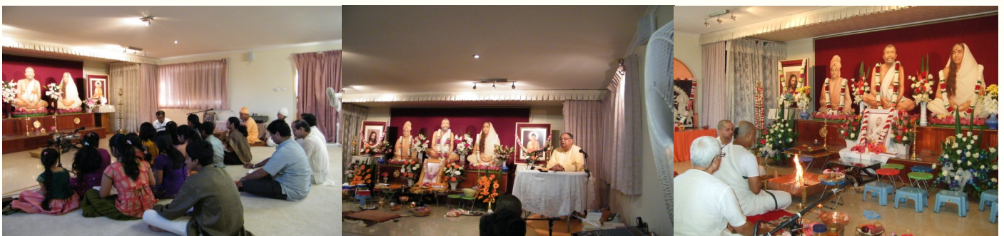
Sydney Centre—the Youth Day (left) and the birth anniversaries of Swami Vivekananda (centre) and Sri Ramakrishna (right).

d) The birth anniversary of Sri Ramakrishna was celebrated on the 23th of February 2012. The programme started after the evening ārati and ended at about 9 p.m. It included readings from the life and teachings of Sri Ramakrishna and singing of bhajans .