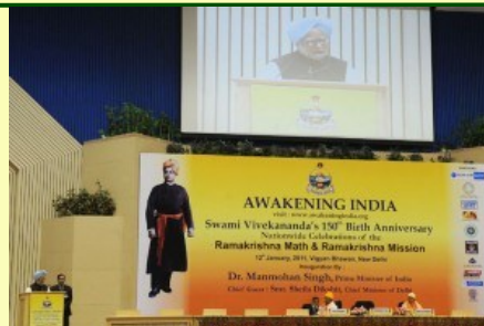
The Prime Minister of India Inaugurated the 150th birth ann. function on 12 Jan. 2011 at Vigyan Bhavan, New Delhi .

7. Organizing Self-Help Groups with the targeted people and take all necessary steps for thrift and savings, bank linkage for deposit accounts as well as micro-finance, undertaking economic activities, marketing of products, holding awareness camps etc.