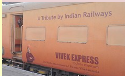
Indian Railways' tribute to Swamiji.