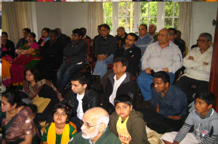
Auckland, NZ Centre— (Above) Durga Puja Celebration.