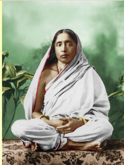
Sri Sarada Devi (1853 -1920)

Between 1909-1919, in the course of her visit to Calcutta or return via Vishnupur, the Holy Mother would stay at Koalpara for at least a few hours and sometimes even for one or two days. Koalpara to the Mother was almost like her 'drawing room.' Even though Jayrambati was not big in size, and there were no aristocrats living there, people still got along with joy and merriment. Whenever possible, they would make arrangements for folk dramas and music. Even today, people of the village can be seen enjoying the sankirtan during the occasion of Durga Puja, Kali Puja and Shitala Puja. There is a temple of Lord Dharma by the name Yatra-Sidhi-Rai in Jayrambati. The other deity of Jayrambati is the well-known Simhavahini. Durga Devi, enshrined in three small images, accepts the worship of devotees in fulfilment of their vows.