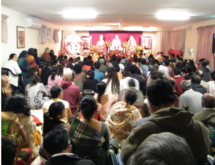
Sydney Centre— (Above) Durga Puja Celebration.