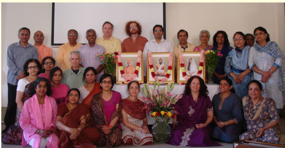
Adelaide Centre— Annual Spiritual Retreat a group photo of participants.

a) Scripture classes at the Centre on the 1st Saturday and Sunday, and second Friday and Sunday of every month. b) Prayer meetings on the 1st Friday of the month in Deception Bay, QLD.