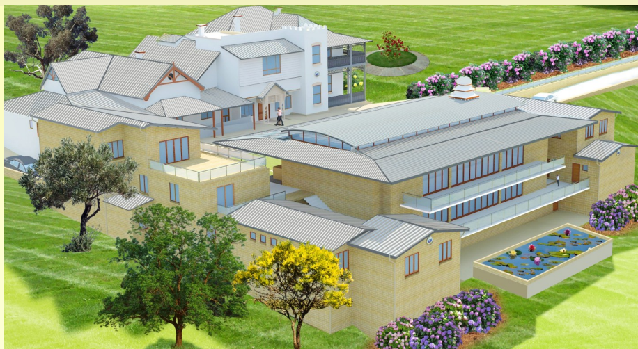
Vedanta Centre of Sydney (An Artist's Impression—birds' eye view) 2 Stewart Street, Ermington, NSW 2115.

Great sayings: The Complete Works of Swami Vivekananda , Vol. viii; Advaita Ashrama, Kolkata; page *280.