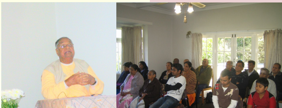
Auckland Centre— Gita discourse

The Complete Works of Swami Vivekananda , Vol. II, Advaita Ashrama, Kolkata, page. 88-104.