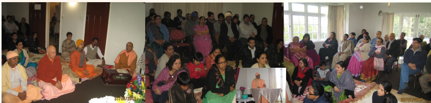
Auckland Centre— Satsanga conducted by Swamis on the 150th birth anniversary of Swami Vivekananda.