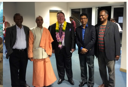
Brisbane Centre— BMS Forum, Spiritual retreat, Hon. Minister Glen Elmes and M. C. members on Annual Day.