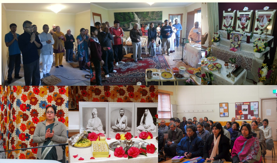
Melbourne Centre— Guru Purnima, the Prayer Meeting and Sri Krishna Janmashtami.