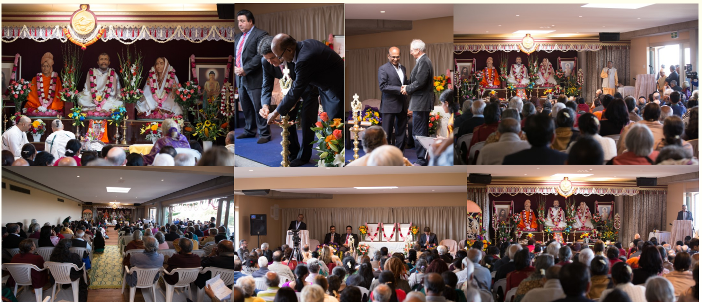
Formal worship, Inaugural meeting, felicitation etc. during the Inaugural Ceremony.

The topic for the speakers at the Devotees Convention was "What 'Vedanta in practice - as epitomised by the lives of Sri Ramakrishna, Sri Sarada Devi and Swami Vivekananda' - means to me". Speakers were invited from each of the city chapters across Australia and New Zealand. It was apparent from the presentations that each participant had developed this same thought in their lives in their own unique way. This evidenced the dictum by Sri