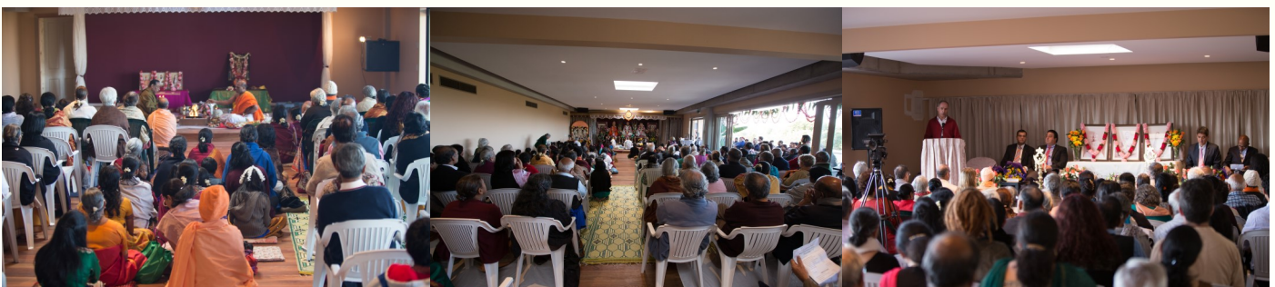
Sydney Centre—Ganapati Homa, formal worship of the Holy Trinity and inaugural meeting.

i) The meetings of the Viveka Youth Group were held on Sundays from