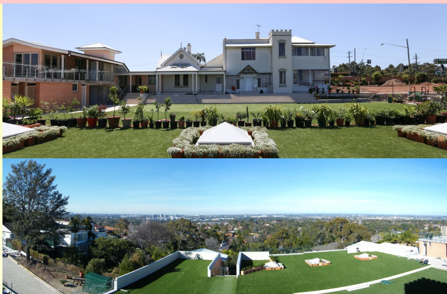
Vedanta Centre of Sydney, 2 Stewart Street, Ermington, NSW 2115. Below—view from Vedanta Centre facing South.

The Complete works of Swami Vivekananda Advaita Ashrama, Mayavati, Himalayas.