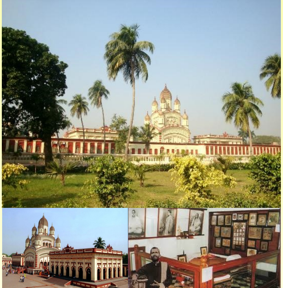
The Kali Temple at Dakshineswar (views from south-east and south-west of the temple) and living room of Sri Ramakrishna.

The current of events in the life of Sri Ramakrishna and his eldest brother flowed fairly fast during the next two