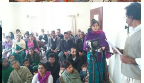
Auckland Centre— Bhagavad Gita class and the Memorial Meeting.