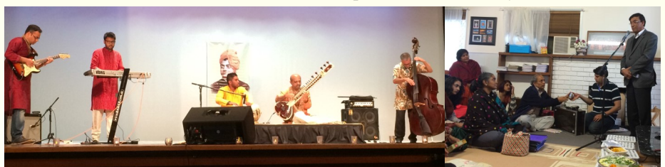
Choir on Annual Day and Memorial Meeting.