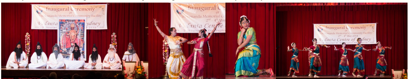
Cultural Programme during the inaugural Ceremony—Drama and Dance items.