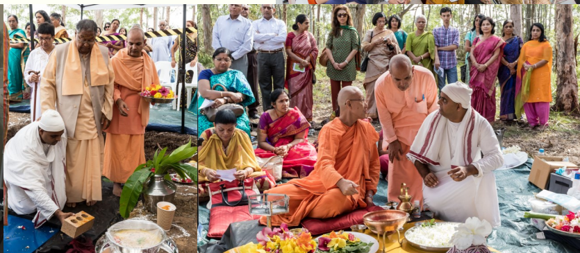
Brisbane Centre— Sri Ramakrishna birth anniversary, the earth-breaking ceremony at the Springfield Lakes site.