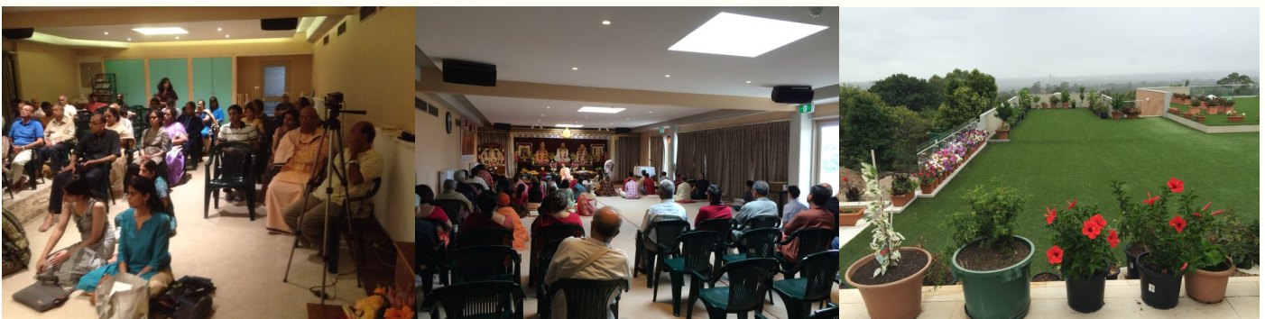
Vedanta Centre of Sydney— Various activities.

h) The meetings of the Viveka Youth Group were held on Saturdays from 5 p.m. to 6 p.m. The