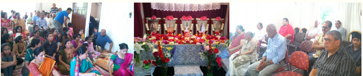
Auckland Centre— Its activities.