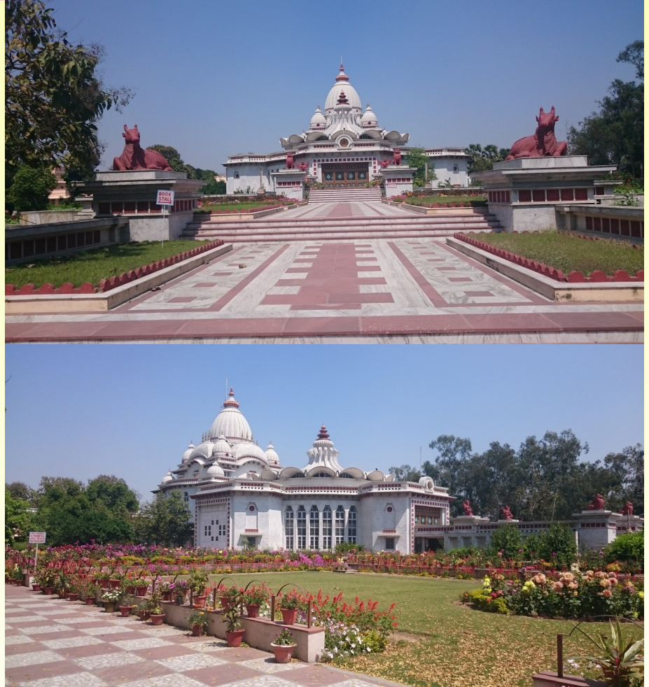
The front and side view of Sri Ramakrishna Temple at the Ramakrishna Math, Niralanagar, Lucknow, U.P. India.

Teachings of Swami Vivekananda Advaita Ashrama, Mayavati, Himalayas, p. 89.