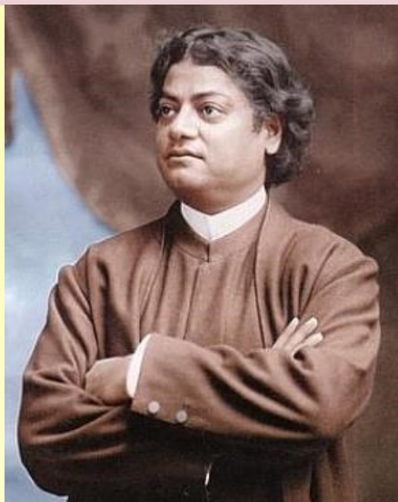
Swami Vivekananda (1863 -1902) (One who enjoys the bliss of Discrimination)

'What a wonderful light I have discovered in those words of the Master. How beautifully he has reconciled the ideal of Bhakti with the knowledge of Vedanta, generally interpreted as dry, austere, and incompatible with human sentiments! What a grand, natural, and sweet synthesis... Those following the paths of karma (action) and yoga (contemplation) are similarly benefitted by these words of the Master. The embodied being cannot remain even for a minute without activity. All his activities should be directed to the service of man, the manifestation of God upon earth, and this will accelerate his progress