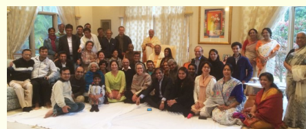
At the Spiritual Retreat