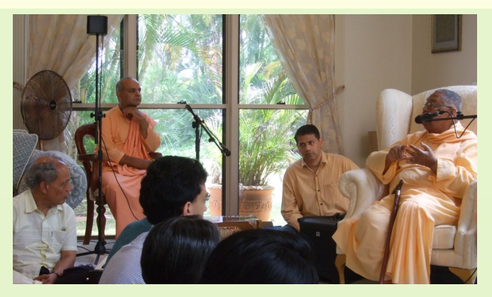
Spiritual Retreat at Bridgeman Downs, QLD November 2015