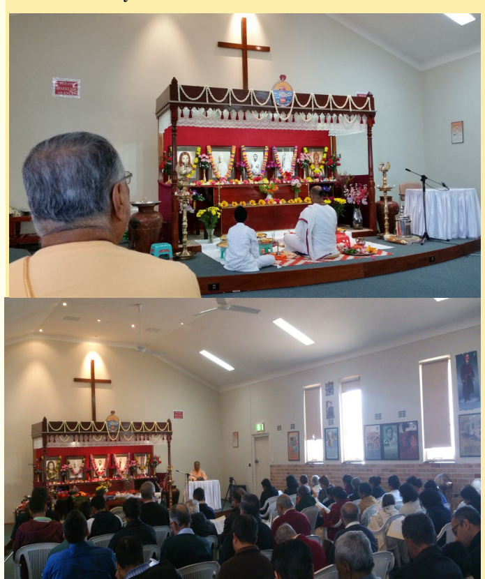
Holy Mother's birthday function.

a) Monthly Satsang on first Sunday of every month from 11:00 am to 12:00 noon. It also entails chanting, Gita Dhyanam, bhajans and readings on relevant topics followed by Prasad distribution.