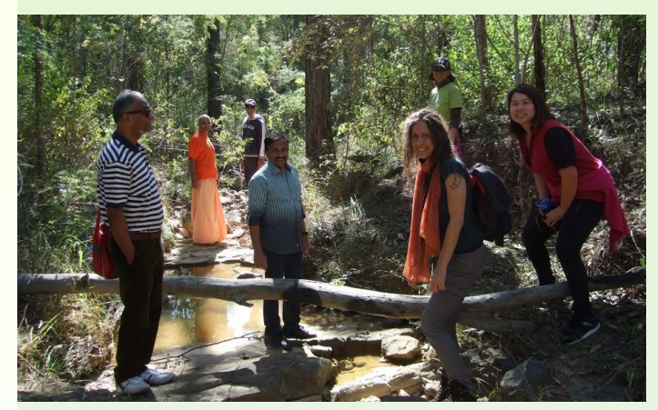
Bush Walk at Mount Coot-tha Gap Creek Road