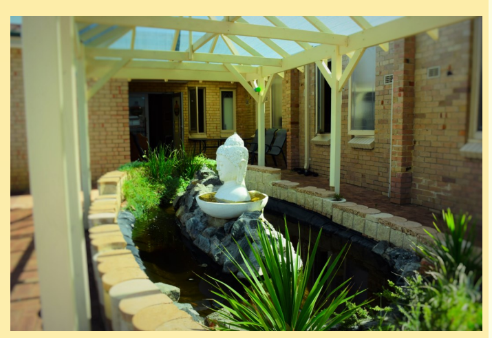
The newly constructed water feature at the entrance of the Perth Centre