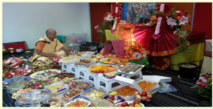
Sri Durga Puja at Springfield Lakes, QLD

e) 'The Significance of death and dying according to Hinduism' at a symposium organised on 22-Oct-2015 by Bluecare Multicultural service and the Metro South Equity & Access Unit (HEAU). Nurses, health care professionals and health service providers were participants in this symposium.