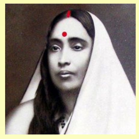
Sri Sarada Devi

The Mukhopadhyaya (or briefly Mukherji) family in which the Holy Mother was born settled in this village long ago. The main road of the