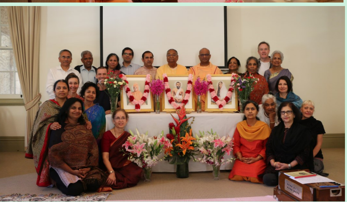
Annual Spiritual Retreat held in December 2015