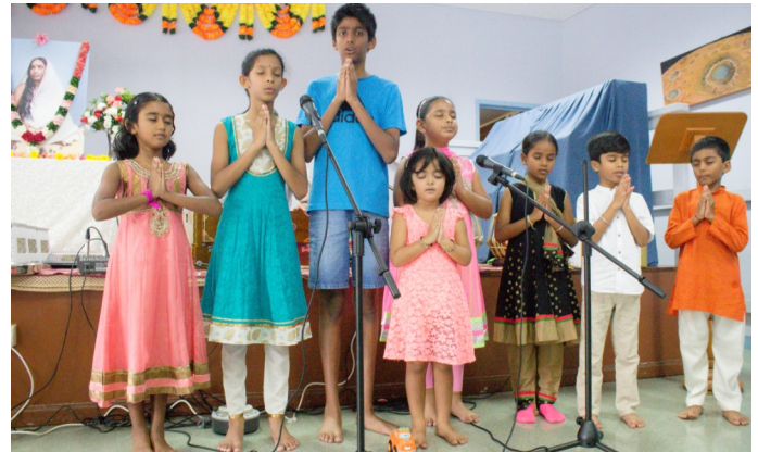
Children of the Bala Sangha at the Public Celebration of Sri Ramakrishna's Birthday on 4 March 2017