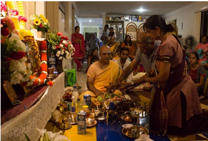
Sivaratri Puja on 24 February 2017