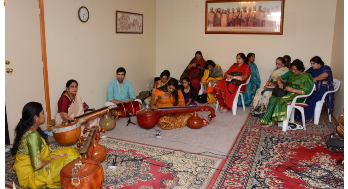
Above: The altar at Melbourne