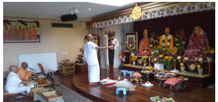
Morning Puja on Sri Ramakrishna's Birthday Celebration on 28 February 2017