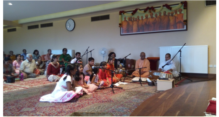
Children of the Bala Sangha perform at the VCS on Swami Vivekananda's Birthday on 19 January 2017

puja was accompanied with chanting and singing, which ended with the abhishekam by the devotees. There were 220 people who attended.