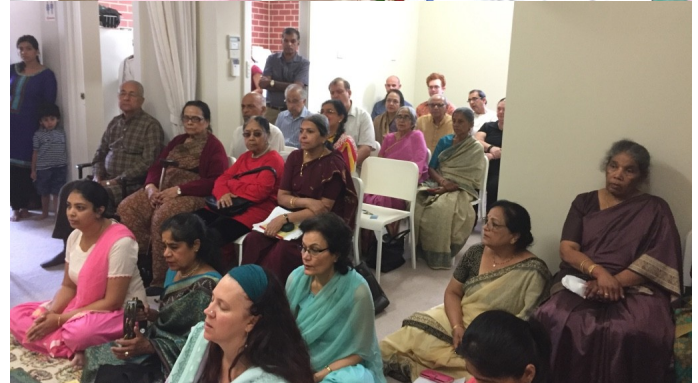
Public Celebration of Sri Ramakrishna's birthday on 11 March 2017