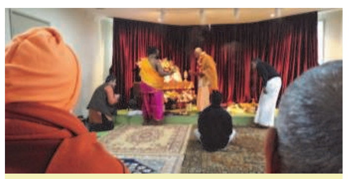
Worship on 28 June 2018