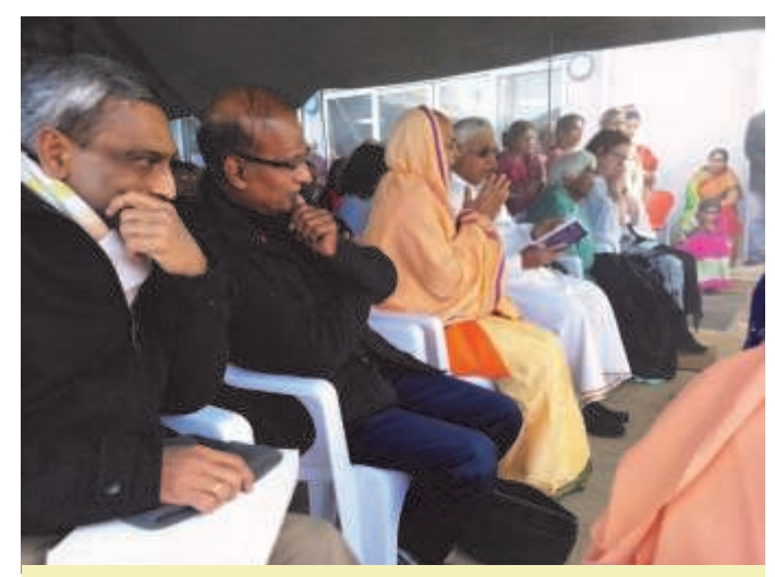
Devotees Witnessing the Worship related to the Divine Mother