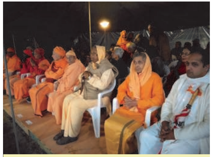
The Witnessing Swamis