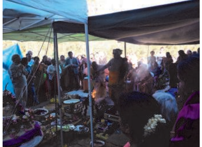
Maha Purnahuti – Worship related to the Divine Mother