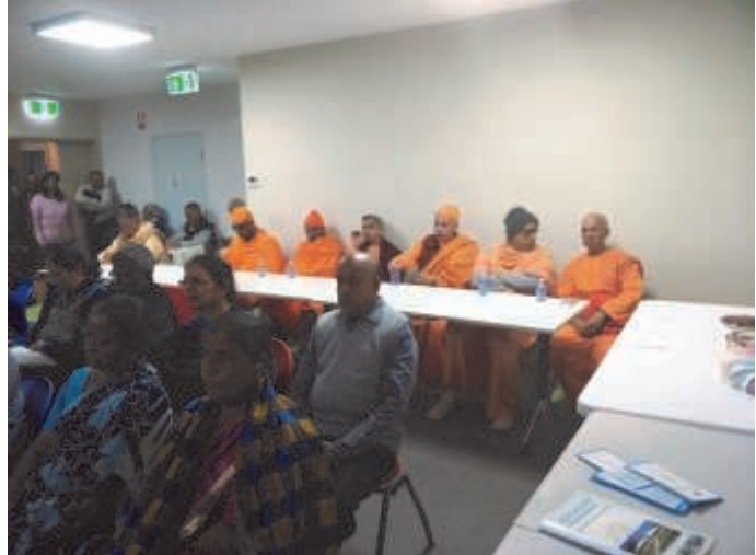
Evening Musical Programme