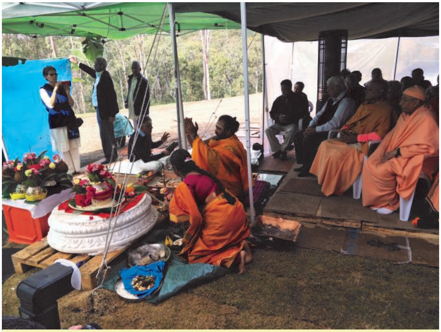
Worship on 28 June 2018