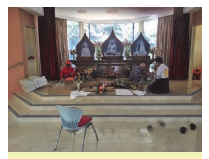
Floral Arrangements for the Shrine