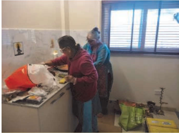
Arrangements for the Worship in the Shrine