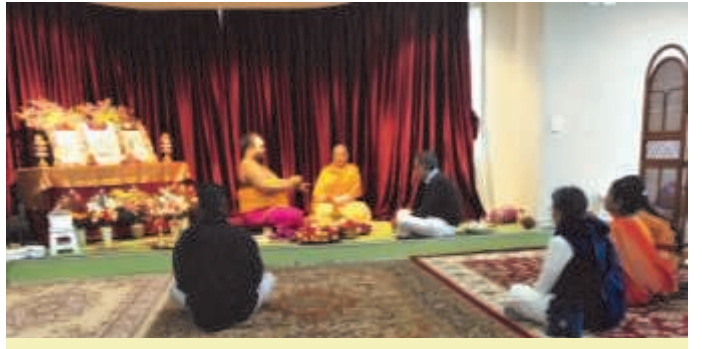
Worship on 28 June 2018