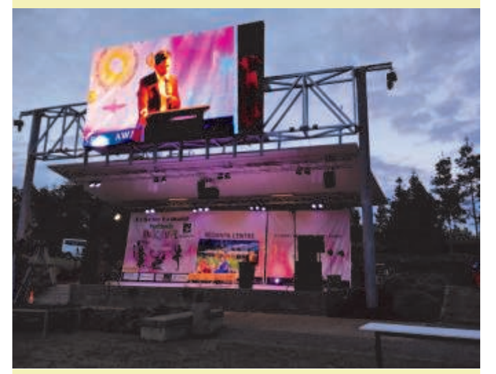
Robelle Domain Parklands, Springfield Lakes