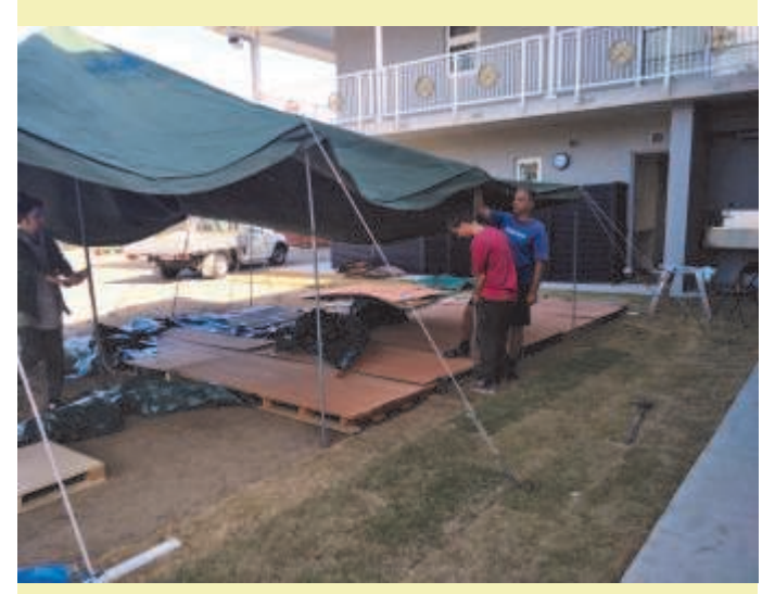
Setting up the Marquee for the Worship Outside