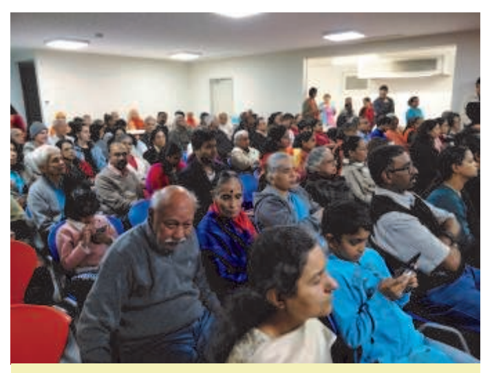
Members of the Audience during the Bhajans