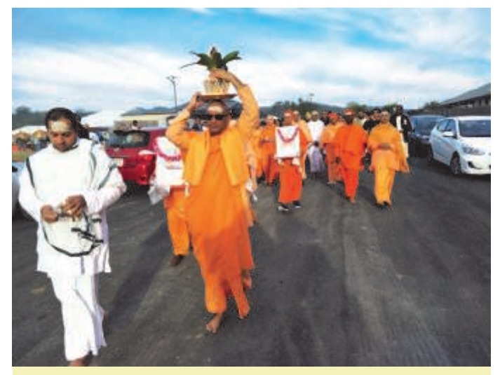
Beginning of the Procession around the Building