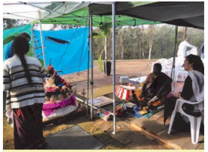
Worship related to the Divine Mother