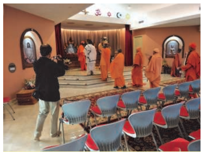
Placing of the photos in the Shrine