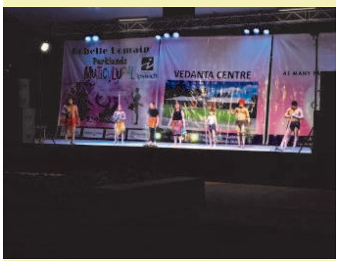
Aboriginal Dance by the Yerongpan Aboriginal Dancers