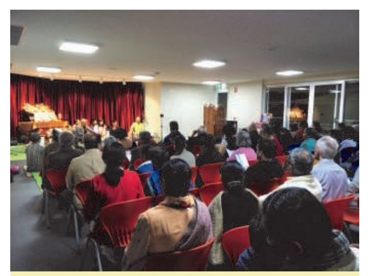
Evening Musical Programme