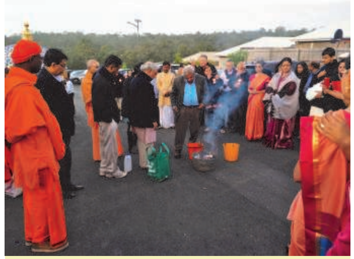
An Aboriginal Elder Performs a Smoking Ceremony