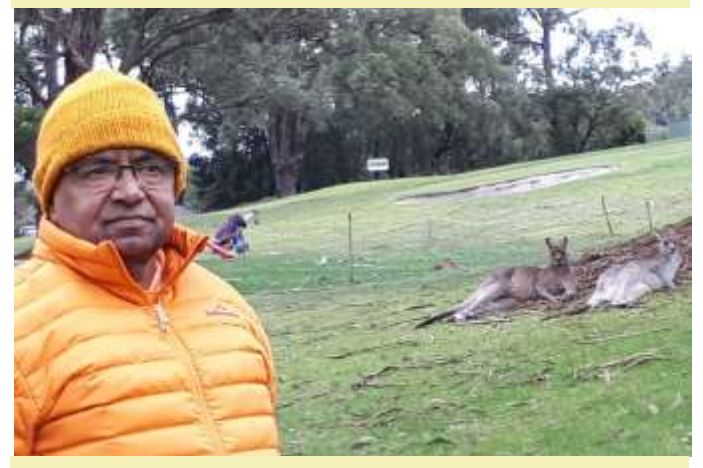
Swami Dhruveshananda in Melbourne

ed the Vedanta Centre of Melbourne from 21 July to 25 July 2018.