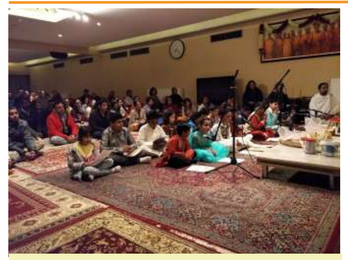
Children of the Bala Sangha performing on the occasion of Guru Purnima