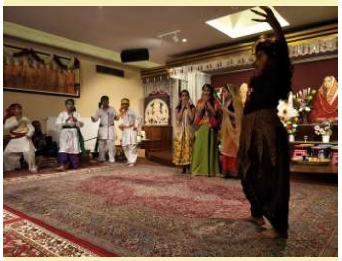
Sri Krishna Janmashtami performance by the children of the Bala Sangha