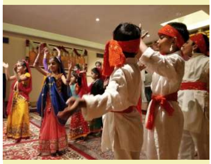
Sri Krishna Janmashtami performance by the children of the Bala Sangha