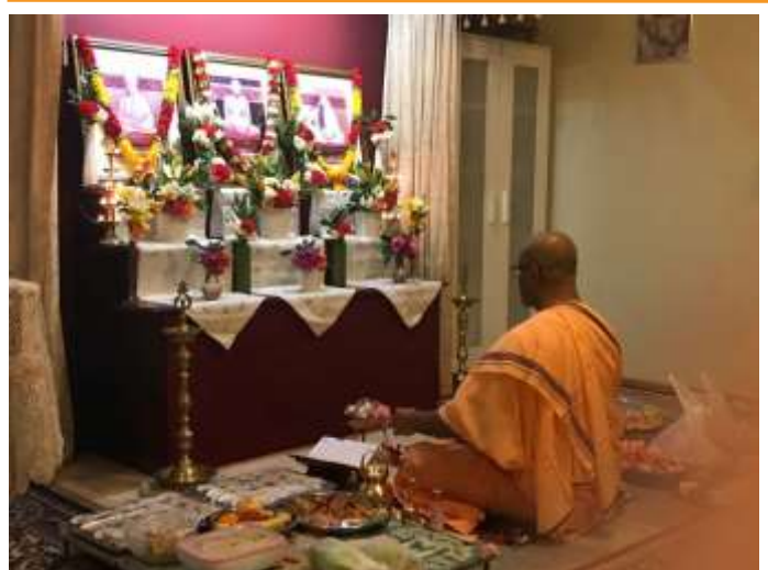
Guru Purnima Puja