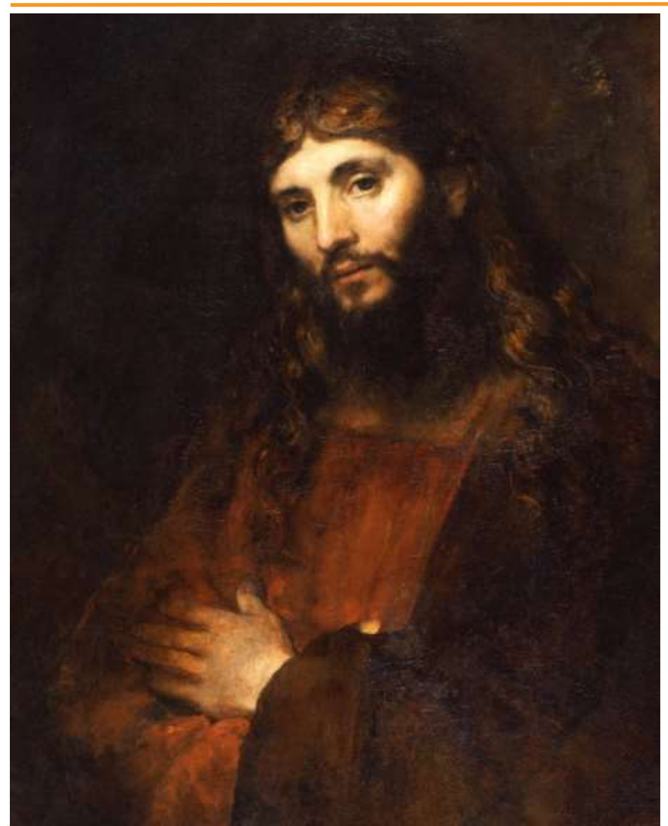
Christ with Arms Folded painting by Rembrandt, <u>The Hyde Collection, Pho-</u> <u>tograph by Joseph Levy</u>

https://www.biography.com/people/jesus-christ-9354382