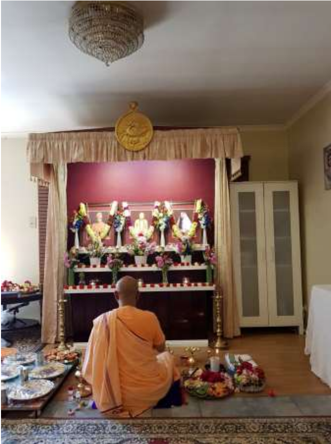
Installation of the New Shrine photos on 17 November 2018