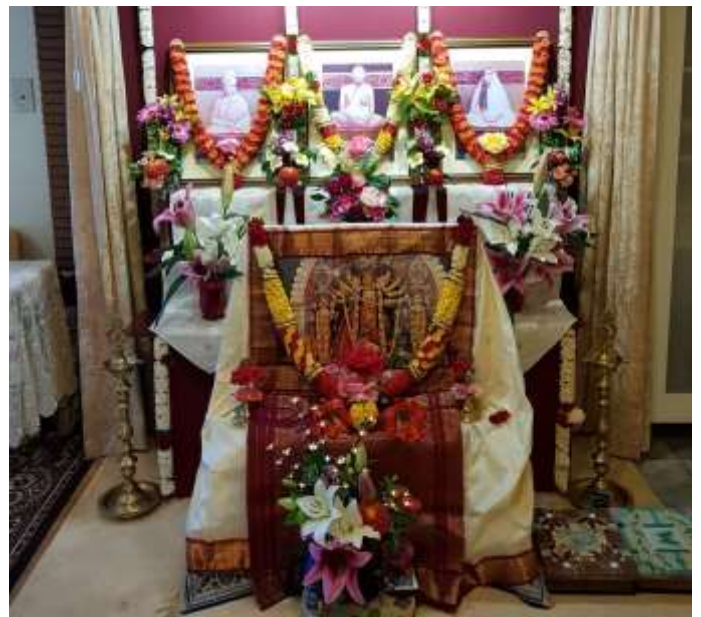
The Shrine During Durga Puja