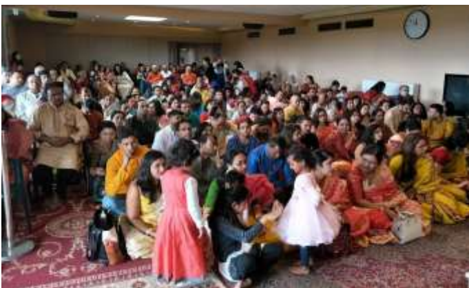
Audience during the Ashtami Puja