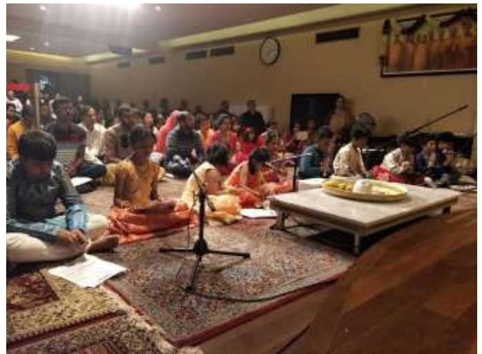
Children of the Bala Sangha performing in the evening after aratrikam