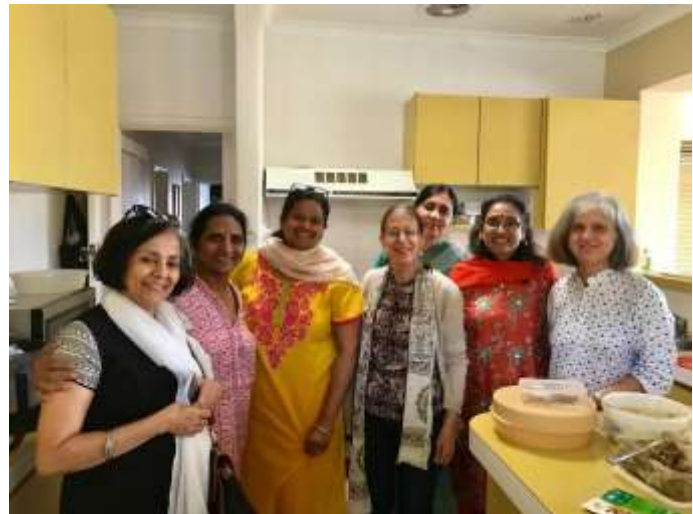
Devotees from Perth