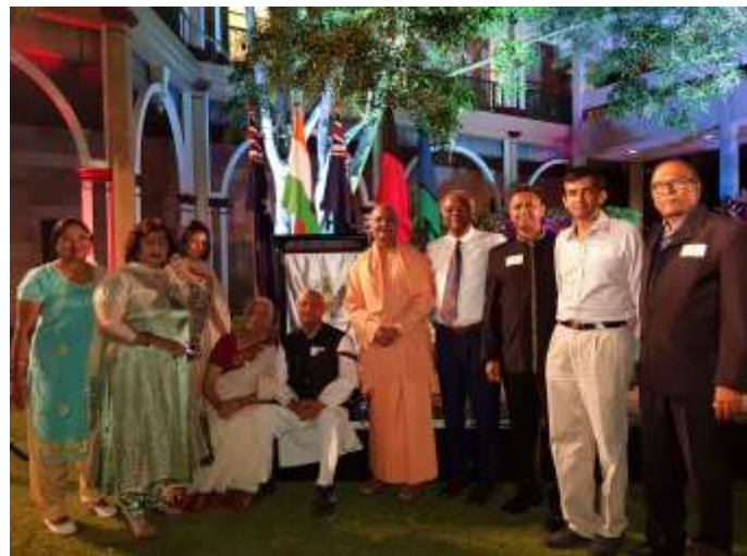
Some of the Indian Representatives at the Premier's Function.