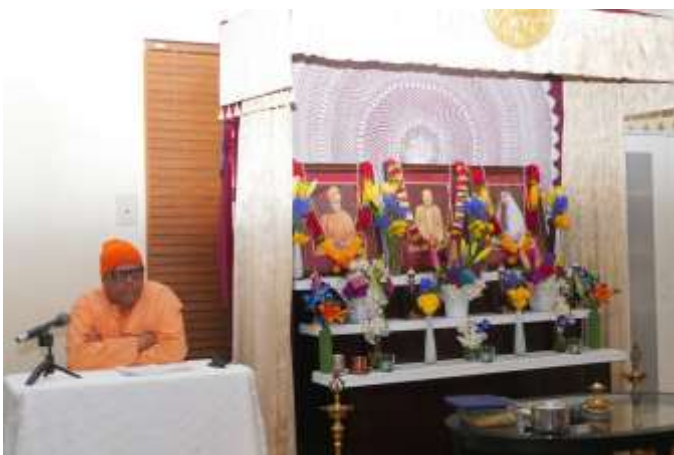
Swami Vireshananda in Melbourne