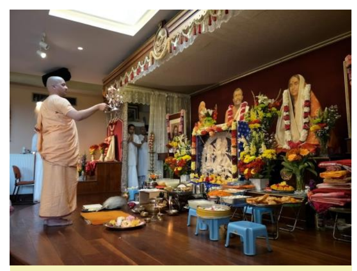
The Worship on the Durga Puja Ashtami

about 1500 people who partook of Prasad in the afternoon and evening.