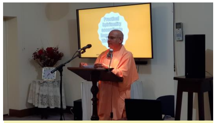
Talk at the Theosophical Society, Brisbane