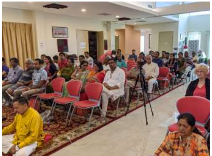
Audience on Kalpataru Day