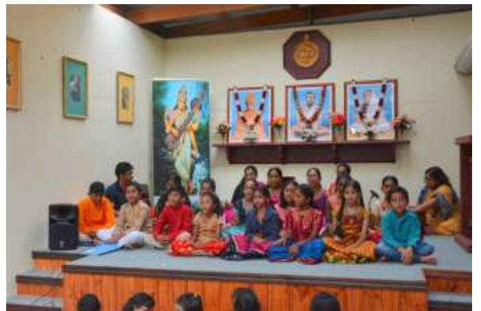
Saraswati Puja in Melbourne