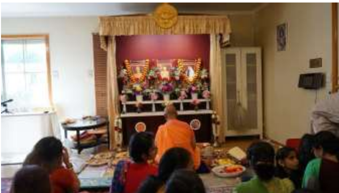
The Holy Mother's Birth Anniversary

topic 'Relevance of Holy Mother's Life.'