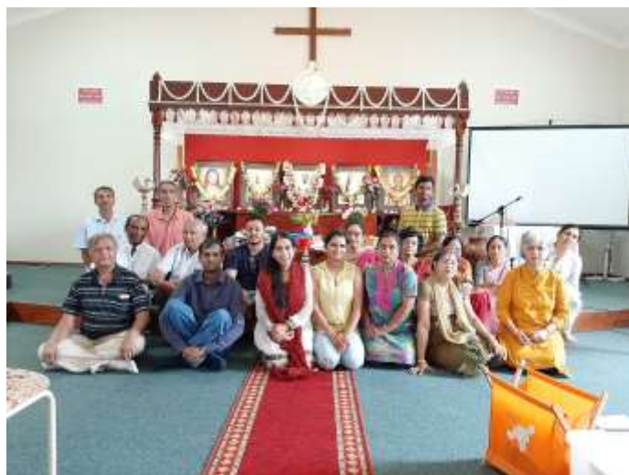
Group Photo of the devotees from Perth