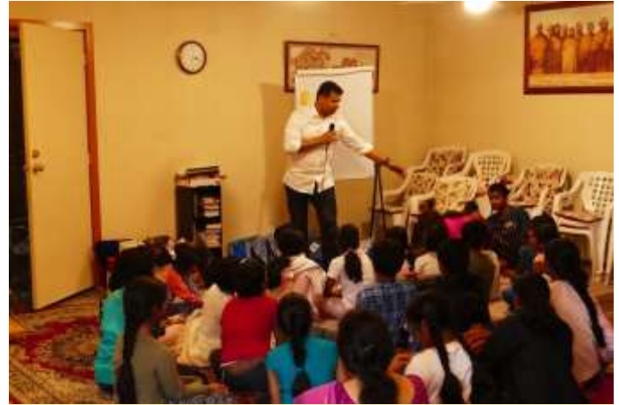
Children's Holiday Programme