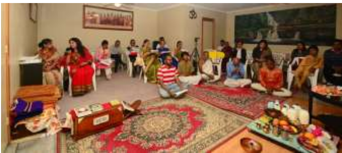
Shivaratri in Melbourne