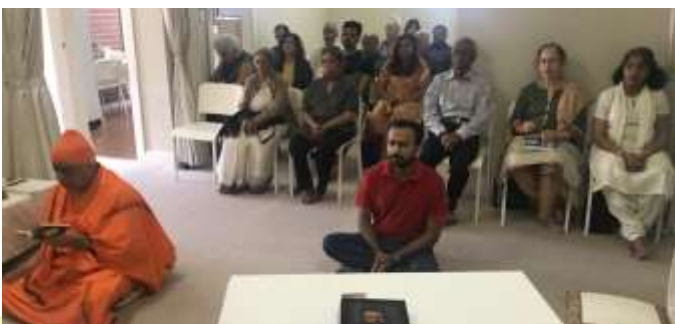
Sri Ramakrishna Mananam Spiritual Retreat