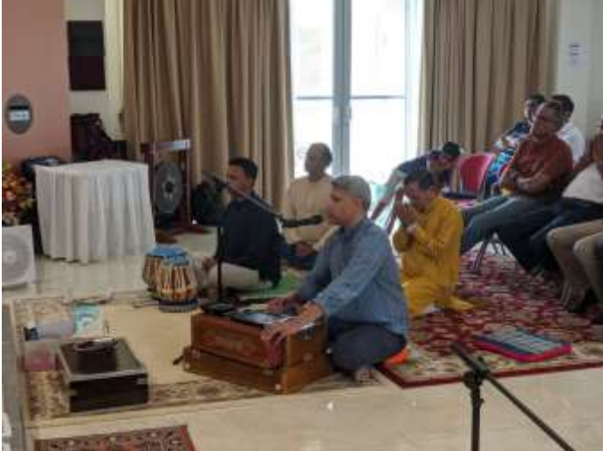
Swami Vivekananda's Birth Anniversary