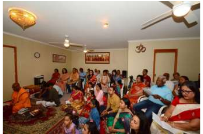
Kalpataru Day in Melbourne