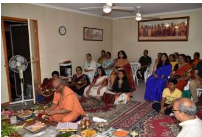
The Worship of Sri Ramakrishna on his Birth Anniversary