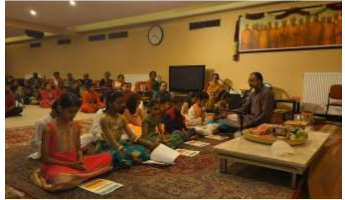
Children of the Bala Sangha on Holy Mother's Birth Anniversary