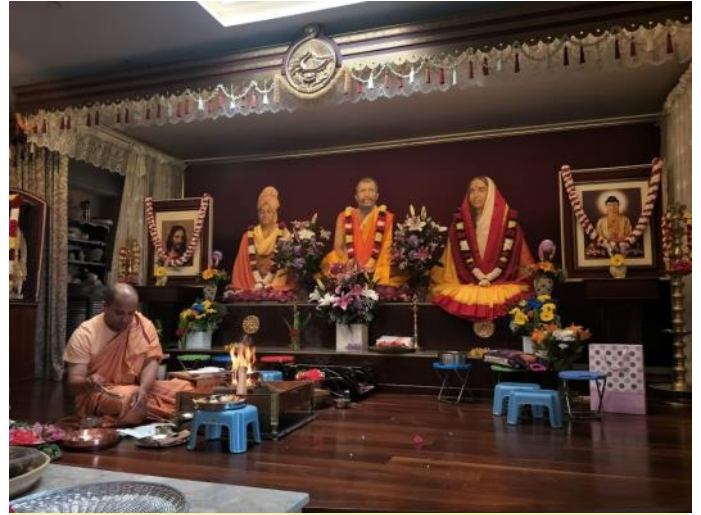
Sri Ramakrishna's Birth Anniversary in Sydney