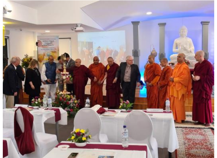
Buddhist Interfaith Function