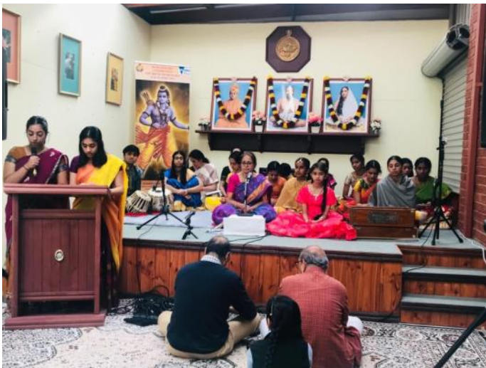
Ramanavami in Melbourne