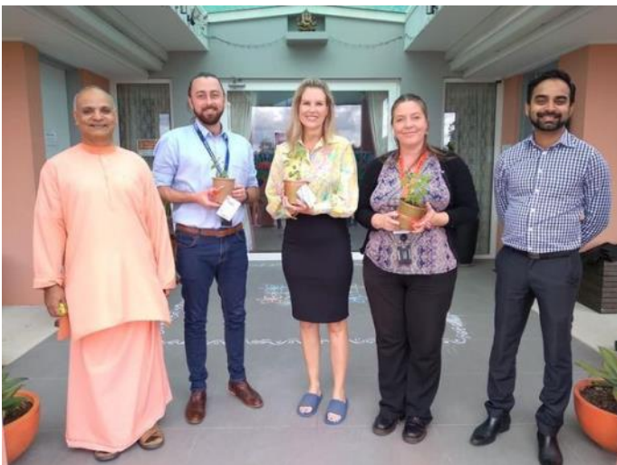
Members from the Ipswich Council