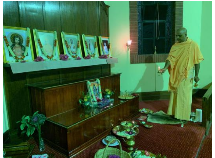
Shivaratri in Adelaide