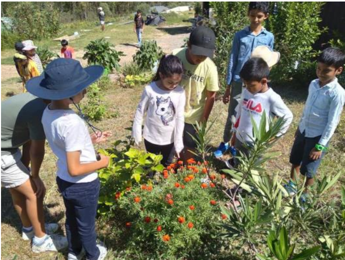
Children's Vacation Camp in Brisbane

jects, insect recognition, creative writing workshop etc. 30 children participated in this programme.