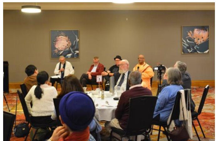
Harmony Day Dinner