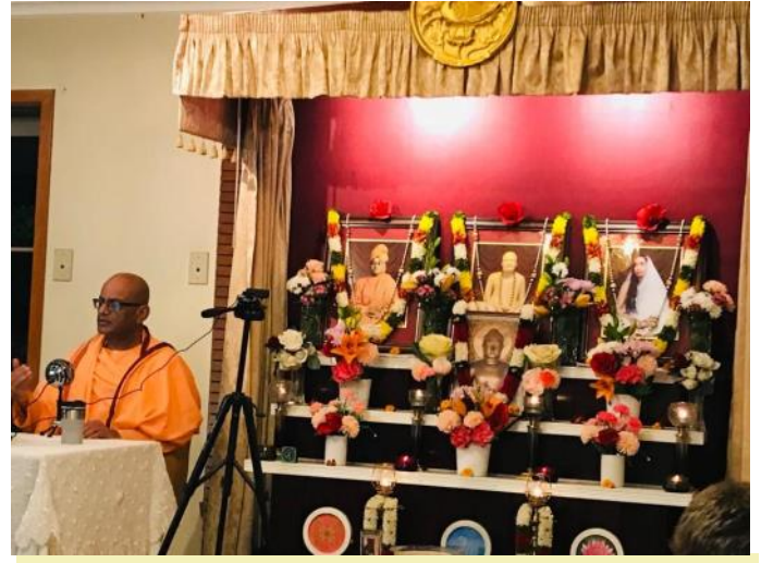
Buddha Purnima in Melbourne