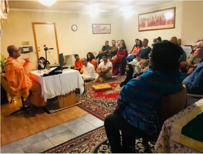
Sri Ramakrishna's Birth Anniversary