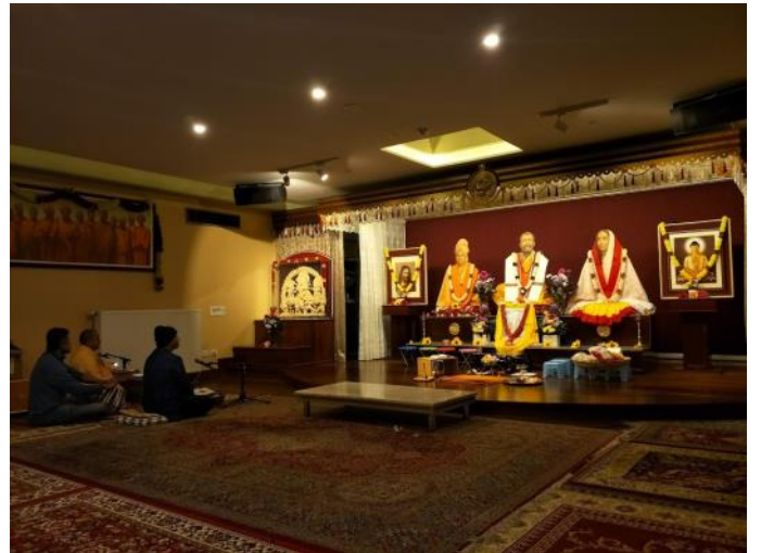
Ramanavami in Sydney