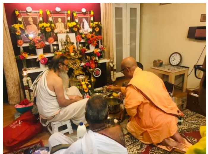
Shivaratri in Melbourne