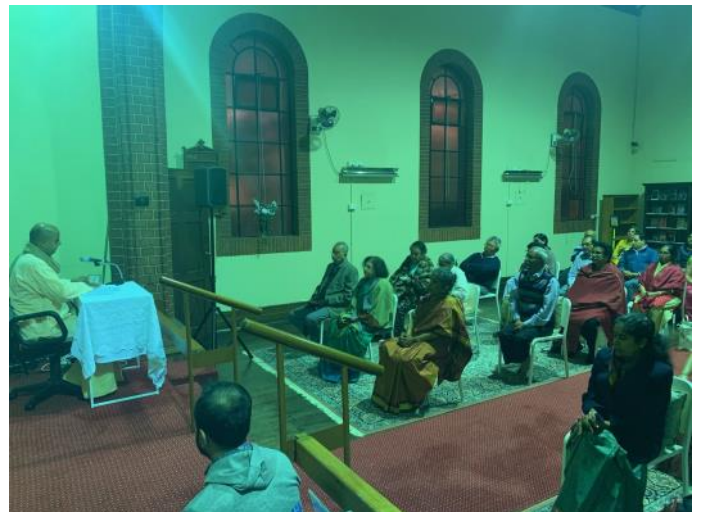
Sri Ramakrishna's Birth Anniversary