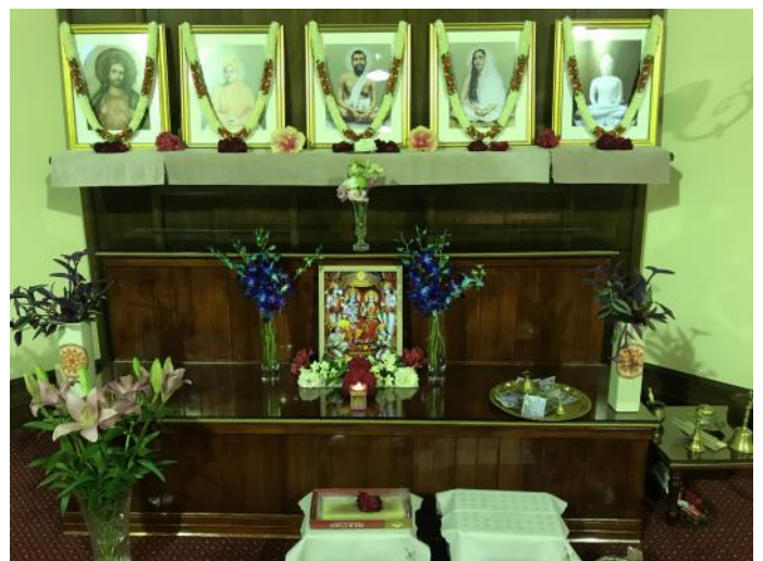
Ramanavami in Adelaide