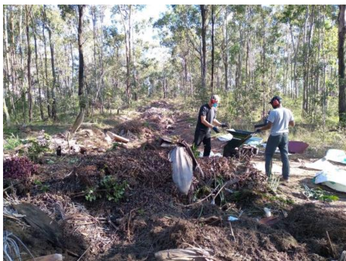
Building the bio-reactors

compost. The link given here gives us an idea of the bioreactors. https://regenerationinternational.org/bioreactor/