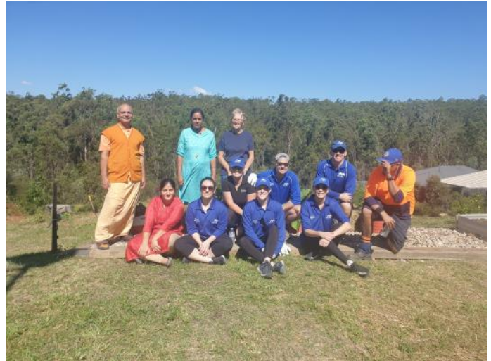
Representatives from the Mirvac Group of Companies

helped in landscaping and other essential maintenance works. This was done as part of their Community engagement programme.