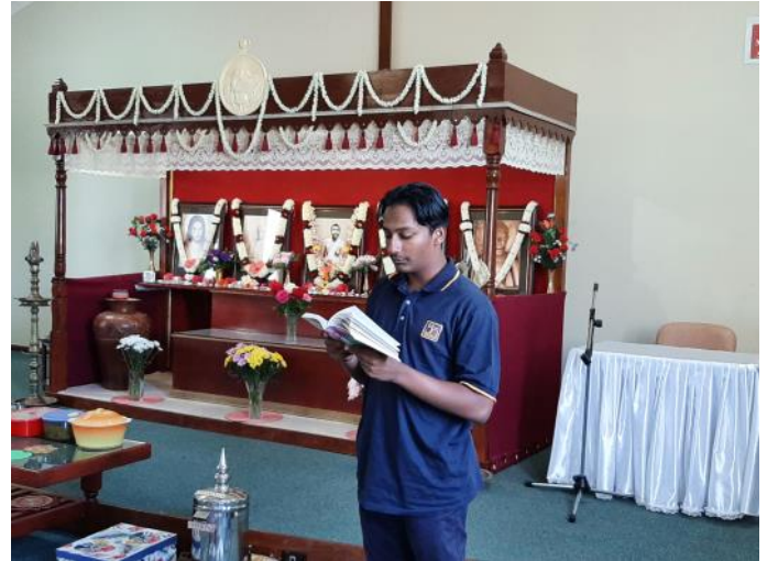
A Reading at Perth