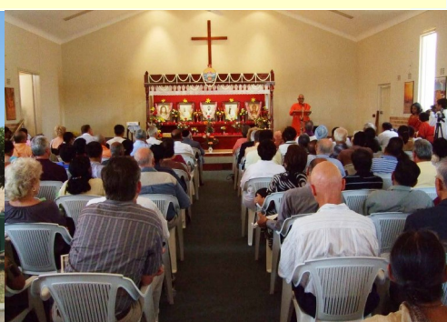
Perth Centre— Shrine, the main building and the occasion of its' inauguration in 2008.