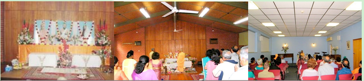
Adelaide Centre— inauguration at the Dulwich Community Centre in 2006 and public lecture.