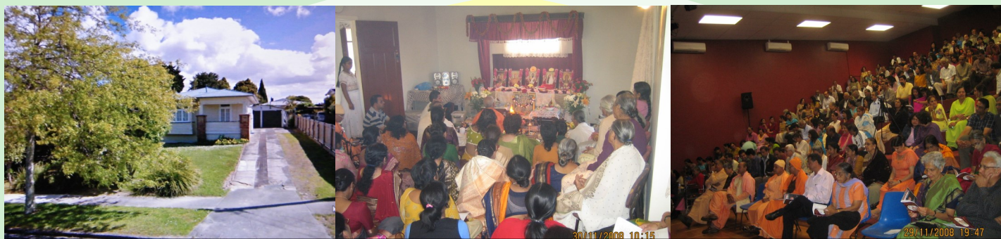
Auckland, NZ Centre— Main building and inaugural sessions of the Centre on 29 and 30 Nov. 2008.