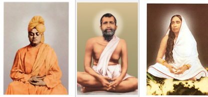
Swami Vivekananda, Sri Ramakrishna and Sri Sarada Devi

“Everything depends on the mind. Nothing can be achieved without