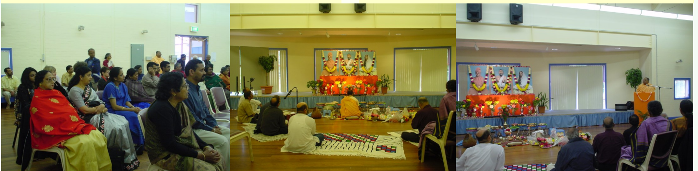
Canberra Centre— Inauguration session at Majura Community Hall in 2004.