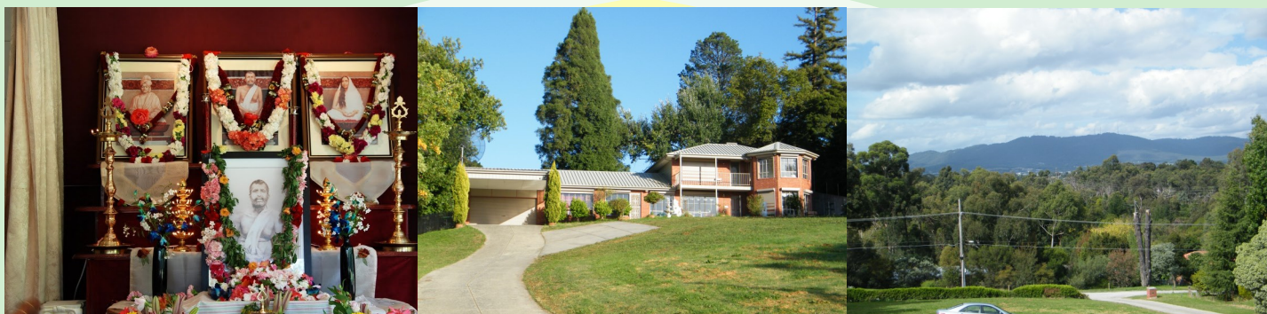
Melbourne Centre— Shrine, the main building and a panoramic view from the Centre