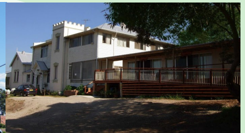
Sydney Centre— Shrine, Main building views from North East and south East