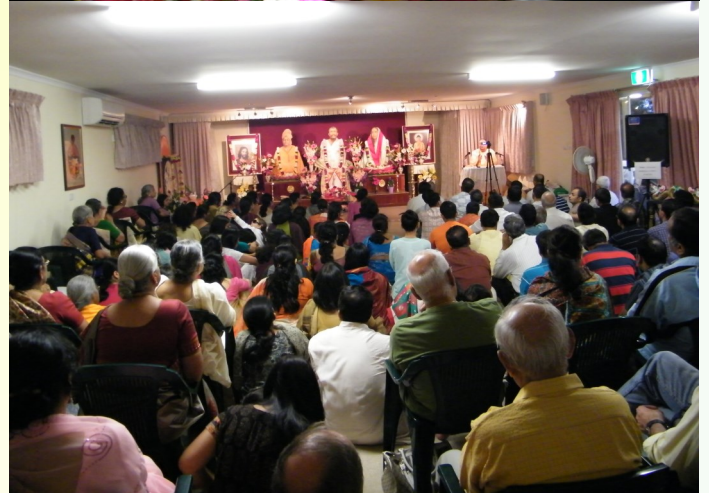
Birth Anniversary of Holy Mother

talk on the life and teachings of the Holy Mother after evening ārati .