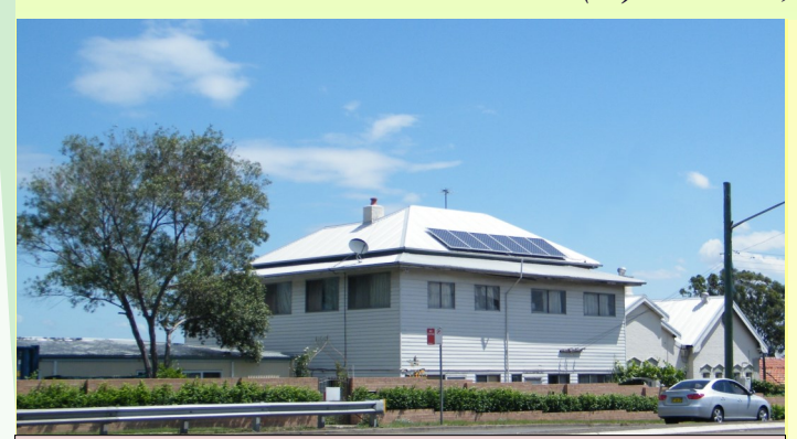
Sydney CentreMain building views from North East

Phone: (02) 8197 7351; Fax: (+612) 8197 7352.