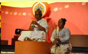
Worship by Balinese