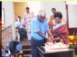
Celebrating the occasion