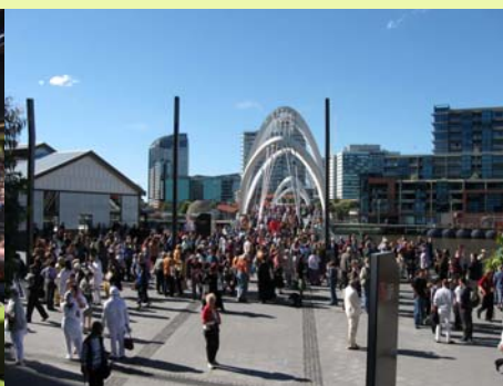
Gathering for a call to save the Earth