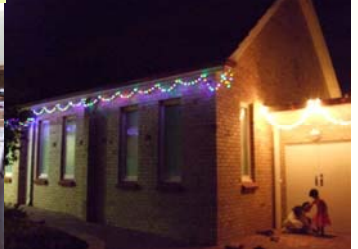
Light decoration at night