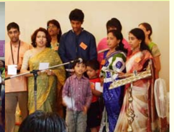
Group singing: God is by your side