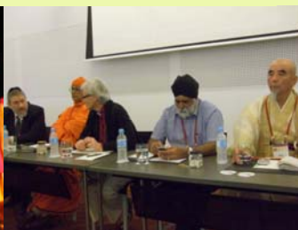
A Panel Discussion