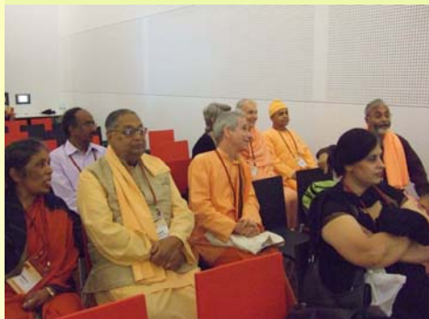
Viewing a documentary on Swami Vivekananda