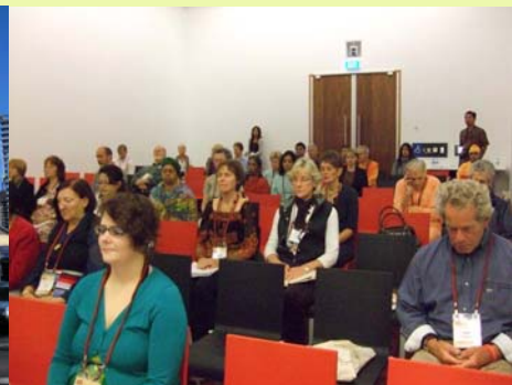
The "Gathering the Mind" meditation