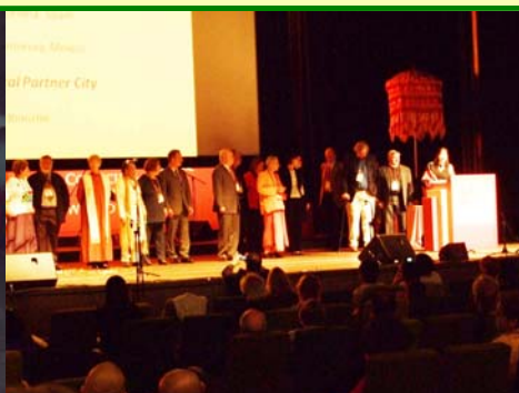
Trustees of the PWR in the opening plenary