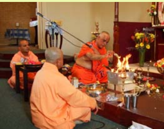
Havan in progress