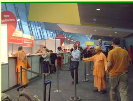
Registration on the 2nd of December 2009