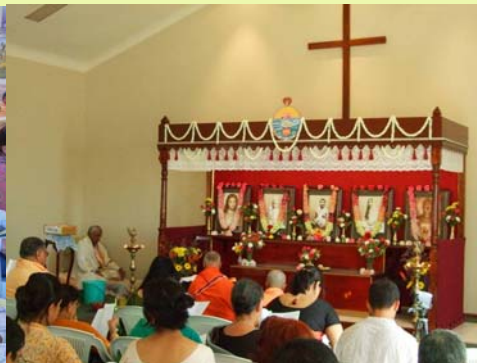
Worship and Chandi recitation in progress