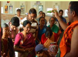
Sprinkling consecrated water