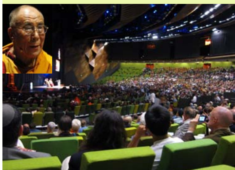
Closing Plenary with Dalai Lama