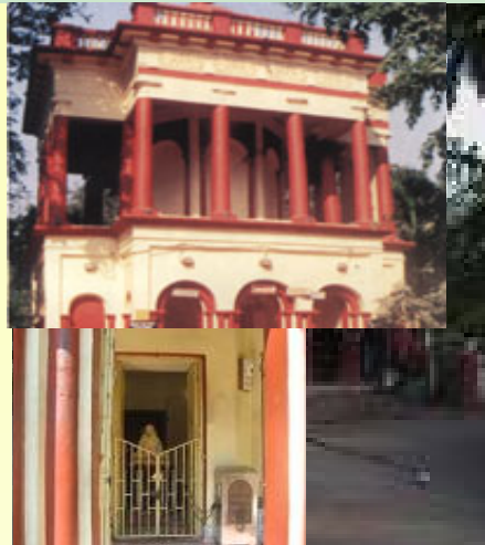
Nahabat, the dwelling place of Holy Mother Sri Sarada Devi

Sarada Devi observed at first hand all the signs of divinity in Sri Ramakrishna. She witnessed his complete conquest of lust and greed. Every woman, to him, was a manifestation of the Divine Mother. He never thought of her in any other way. Money and worldly possessions never tempted him in the slightest degree. If he touched a coin he felt as if his body had been, as he would say, "Stung by a horned fish." She said later that complete renunciation was his special message to this age. Sarada Devi watched his frequent samadhis (spiritual ecstasies), in which he was totally absorbed in God. She loved to hear devotional songs. When Sri Ramakrishna sang and danced with the devotees in ecstasy in his room, he would ask that the door of his room facing the Nahabat be left open saying, "In this room intense feeling and love of God will be expressed. She must witness it; otherwise, how will she learn?"