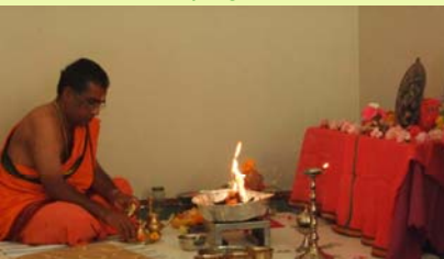
Worship of Ganesha and Havan