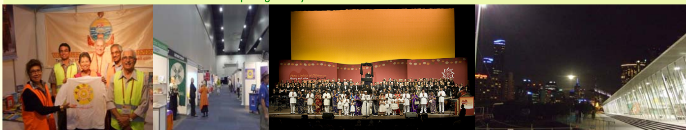
Bookstall of the Vedanta Centre and the Stall Area