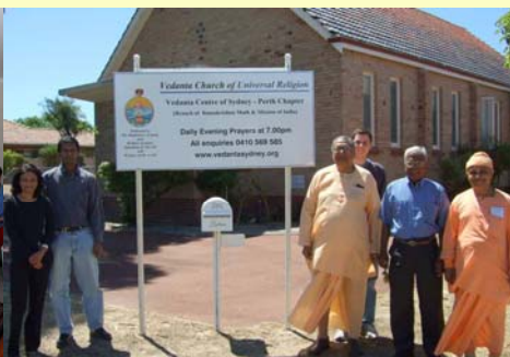
Vedanta Church of Universal Religion, Perth