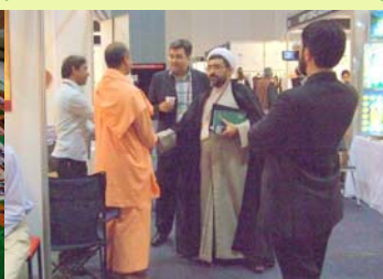
Iranian delegates and a Television Channel interviewing Swamis