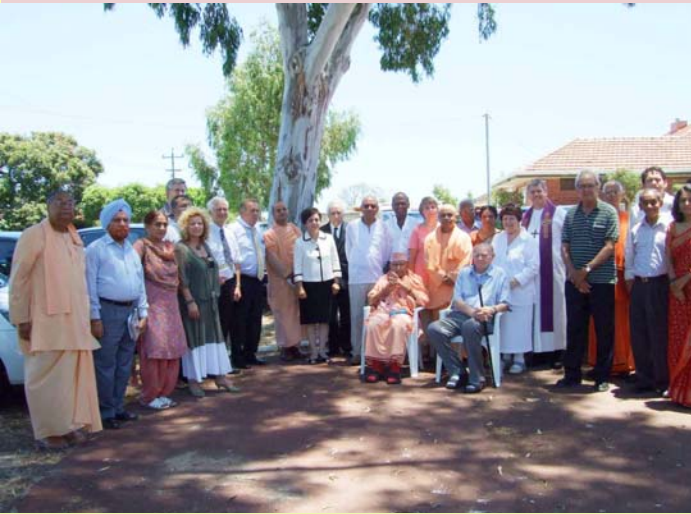
A group photo in front of the Church

A photo Album is given below of the two-day Inauguration Ceremony of the Vedanta Church of Universal Religion held on the 19th and the 20th of December 2009 at 51 Golf View Street, Yokine, W.A.