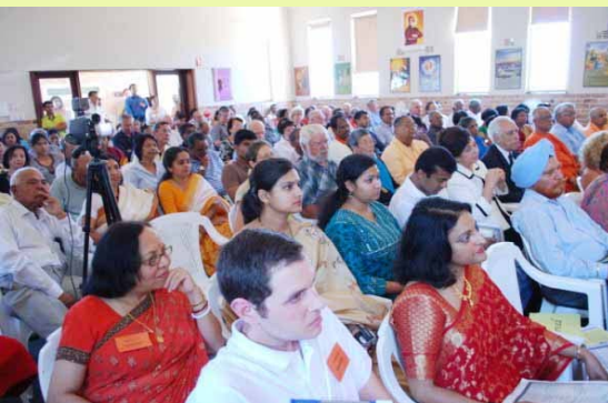
A section of the audience