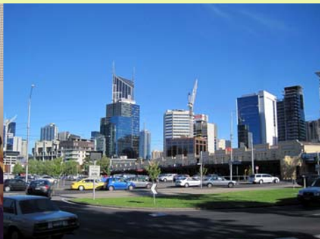
Melbourne Convention Hall