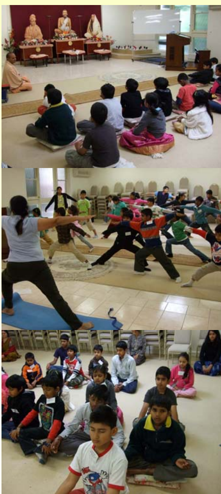
Summer Retreat for Children at Ashfield Centre

Christmas Eve was celebrated on the 24 th of December 09 after vesper service. It included singing of kirtans and readings from the Sermon on the Mount according to Vedanta , Christ the Messenger , and Life of Jesus Christ.