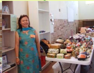
A gift shop