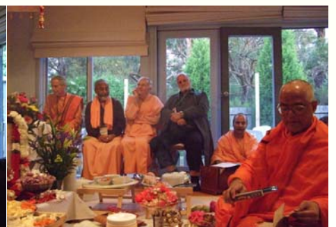
Birth Anniversary of Holy Mother Sri Sarada Devi at the Melbourne Centre on the 8th of December 2009