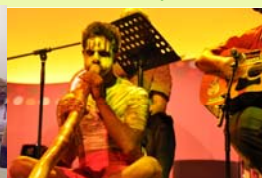
Sound of Didgeridoo