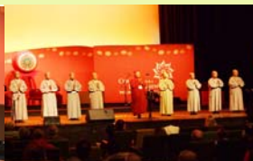
Buddhist Monks at prayer