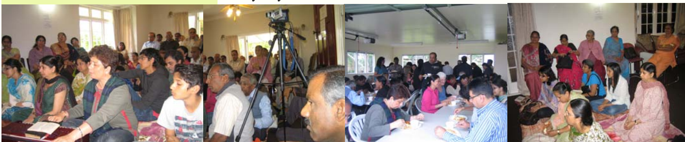
Bhajan in progress during the visit of Swami Sridharananda and Prasad distribution at the Auckland Centre