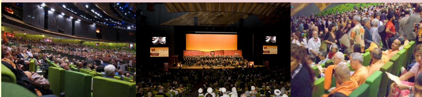
The Opening Plenary session on the 3rd of December 2009

The theme of the PWR in Melbourne was: 'Make a world of difference: hearing each other, healing the earth.' The venue chosen was fitting – the brand new Melbourne Exhibition and Convention Centre on the banks of the Yarra river. Approximately 5500 delegates from 80 countries representing nearly 250 religious groups attended the PWR including around 1250 speakers and presenters. There were 640 odd sessions during this week-long Convention, some of them unique in the subject matter and presentation, including talks, group discussions, dialogues, Yoga, meditation, worship sessions, art appreciation, dances, music and a variety of performances.