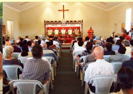
Multi-faith Meeting in progress

At 2 Stewart Street, Ermington, chanting, meditation and daily worship are held every morning from 7 a.m. to 9 a.m. and a vesper service is conducted in the evening at 7 p.m. that includes devotional singing and a reading from The Gospel of Sri Ramakrishna since completion of reading the Gospel of Holy Mother Sri Sarada Devi in December 2009. Counselling, interviews and discussions with devotees are also conducted on a daily basis. The library is available to devotees for reference and research.