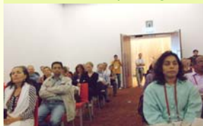
Video on Swami Vivekananda