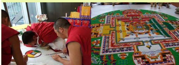
Buddhist Monks at an intricate Manadala painting and a completed one