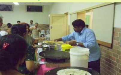
A special treat