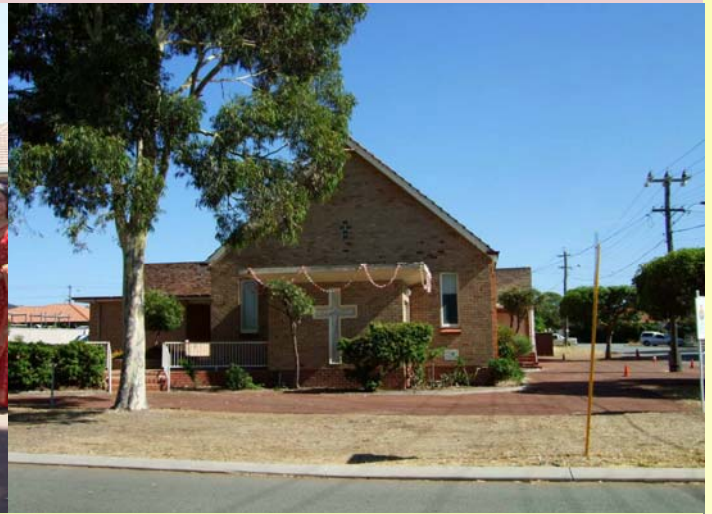
Vedanta Church of Universal Religion