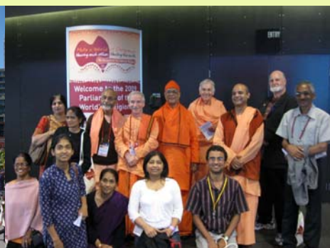
Swamis and devotees at the PWR