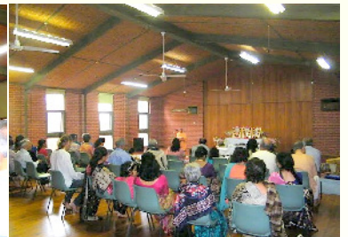
Worship and talk during the Annual Celebration in Adelaide.