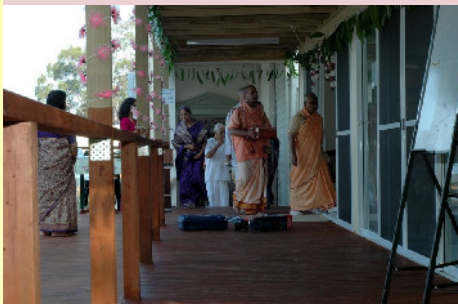
Holy Relics are brought and installed in the Shrine.

A photo album is given below of the day-long Inauguration Ceremony of the New Shrine at 2 Stewart Street, Ermington, N.S.W. 2115 held on the 28th of March 2010.