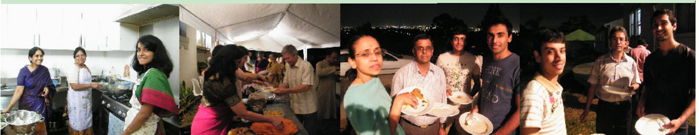
Volunteers in the Kitchen