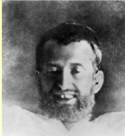
Sri Ramakrishna in Samadhi

When this vision ended, an incessant and violent urge for a constant, uninterrupted vision of the Divine Mother's luminous form arose in the Master's heart. Although this longing did not always manifest itself externally through signs such as weeping, it remained in his heart all the time. Sometimes it would increase to such a point that he could not contain it anymore. Restlessly rolling on the ground