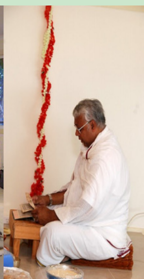
Recitation of Sri Chandi