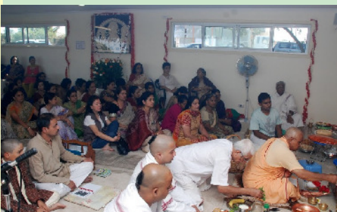
The worship of Sri Ramakrishna and a section of devotees.