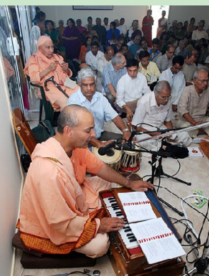
Arati being performed after the worship of Sri Ramakrishna.