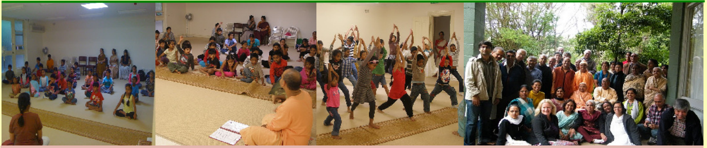
Various activities in the Children's Retreat at Vedanta Centre of Sydney