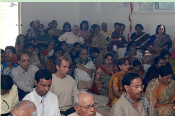
Devotees during the worship.