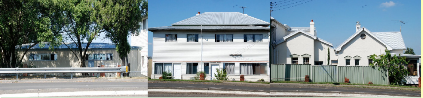
Vedanta Centre of Sydney North view from Stewart Street