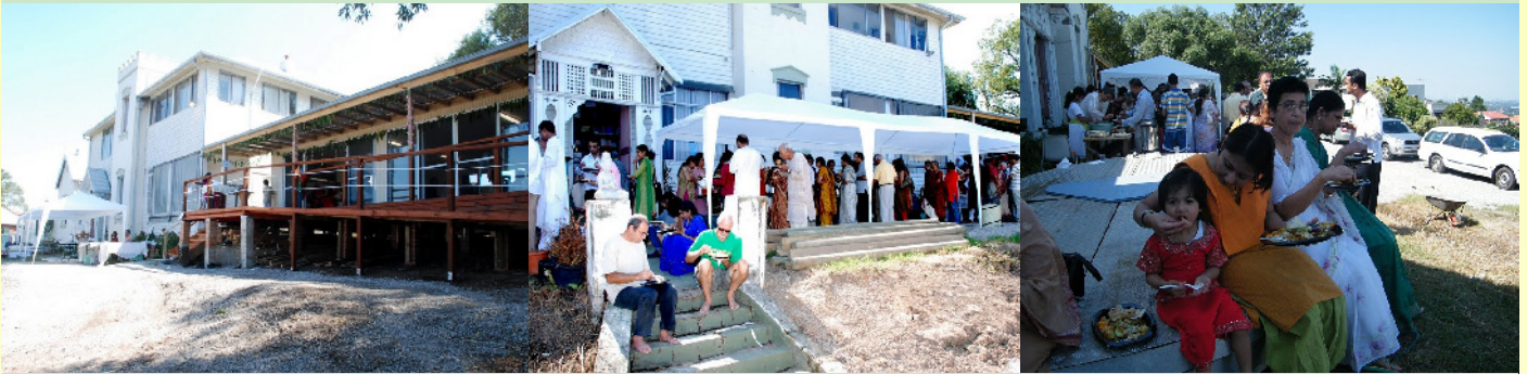
South-east view of the Shrine Hall