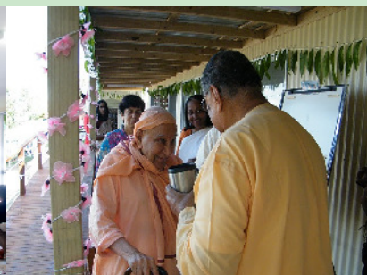
Senior Swamis of the Centre