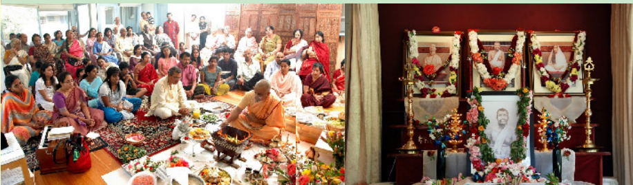
Sri Ramakrishna birth anniversary, Melbourne