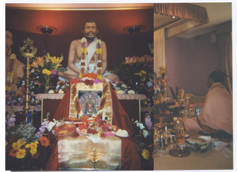
Sri Sri Durga Puja in progress

To accommodate its added activities Australia-wide and to make its permanent abode, the Vedanta Centre of Sydney was looking for a larger place for quite sometime. The Centre has recently procured a property at 2 Stewart Street, Ermington near Dundas and Eastwood, Sydney, overlooking the Paramatta Valley. The registration of the property was completed on the 31st of October 2006. It measures 3570 sq.metres and has a 125 years old two storied residence. Plans are ahead to renovate it and make it habitable and then to develop it to accommodate other activities of the Centre. The donations towards the Building Fund are Taxdeductible and would be gratefully appreciated and acknowledged.