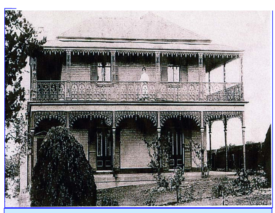
Two storied residential building at acquired New Property

"By you this universe is borne, by you this world is created. By you it is protected, O Devi! and you always consume it at the end. O you who are (always) of the form of the whole world, at the time of creation you are of the form of the creative force, at the time of sustentation you are of the form of the protective power, and at the time of dissolution of the world, you are of the form of the destructive power. You are the supreme knowledge as well as the great nescience, the great intellect and contemplation, as also the great delusion, the great devi as also the great asuri."